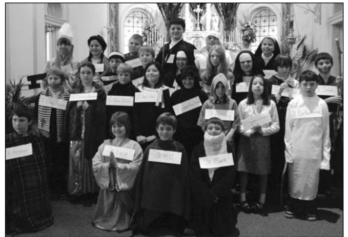
Combined 4th and 5th Grades in their Saint costumes after the Feast of All Saints Mass